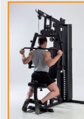
lat machine back