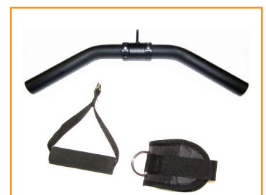
triceps bar, pulling ankle cuff and handle included